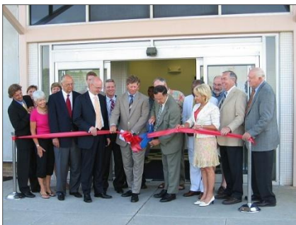
Local officials dedicate the former Airport Terminal Building as a Business Incubator

During this fiscal year, a long term goal of SWED came to fruition with the renovation of the former Airport Terminal Building into a small business incubator. Spearheaded by SWED with strong support from the Wicomico County Council, the Wicomico County Airport Commission, Maryland's Department of Business and