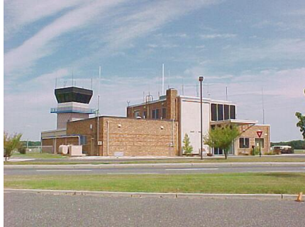
The former Airport Terminal Building

Also at the airport, SWED continued its pursuit of establishing a "business incubator" in the former airport terminal building. The goal is to provide relatively inexpensive space with flexible lease terms to new, expanding and technology-oriented companies. During this fiscal year, SWED, along with the Airport Commission was successful in securing renovation funds through Maryland's Community Development Block Grant program and through the Maryland Aviation Administration. The renovation is expected to be completed by the end of October and we continue to work with several prospects interested in locating to the facility.